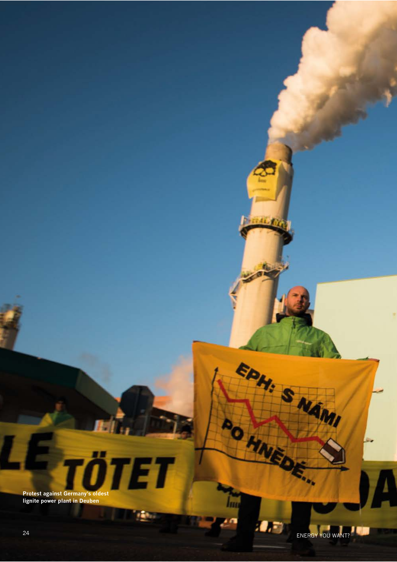
Protest against Germany's oldest lignite power plant in Deuben