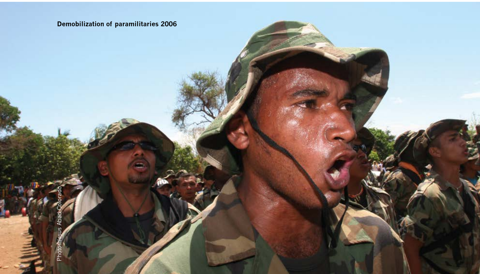
Demobilization of paramilitaries 2006

The companies vehemently deny such allegations, and the Colombian justice system is notorious for its unwillingness to respond to, or even investigate crimes attributed to powerful companies. The only judgment that