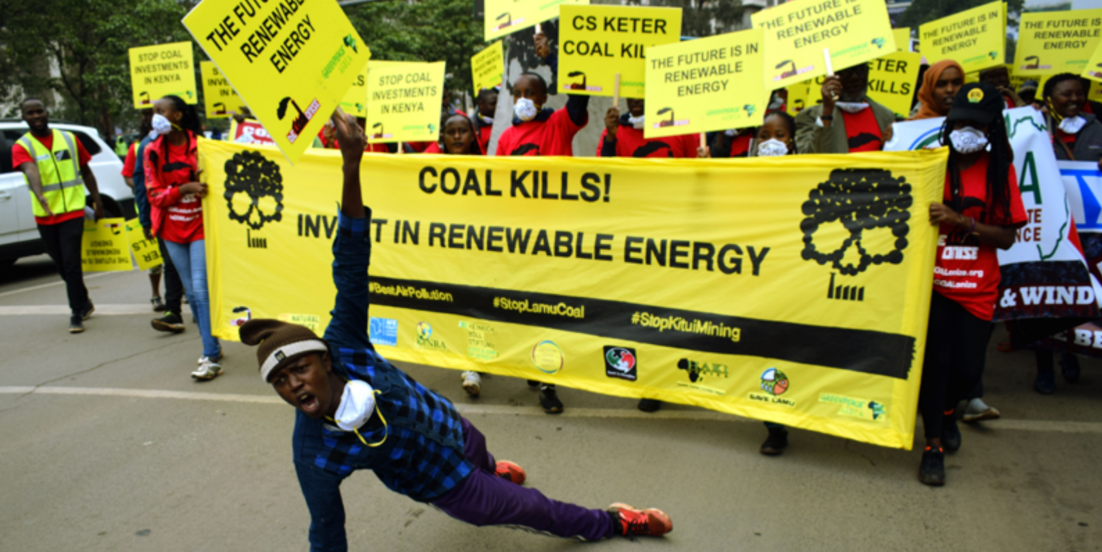
Protest against coal power and coal mining in Kenya (12. Juni 2019).

followed, the banks either got their bad loans transferred to the asset management companies or received a direct capital injection from the central government.